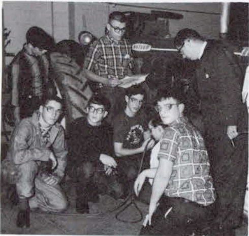
The Ag boys in the Junior-Senior Ag class are using a tester on one of the tractors to check for cylinder leakage.